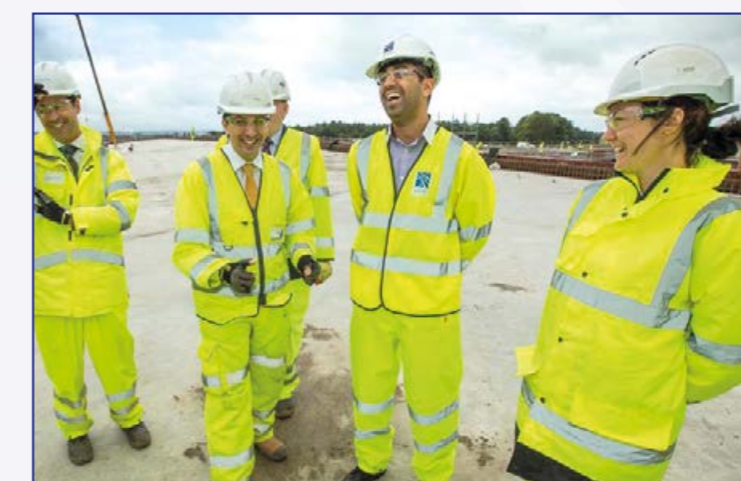
Transport Minister Humza Yousaf meets project construction team

MINISTER for Transport and the Islands Humza Yousaf paid a visit to see the progress of the M8 M73 M74 Motorway Improvements Project as a spectacular aerial video showing the new M8 'missing link' was unveiled in August.