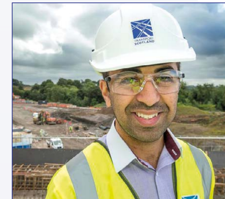
Humza Yousaf visits new M8

Watch drone footage at: www.transport.gov.scot/m8m73m74