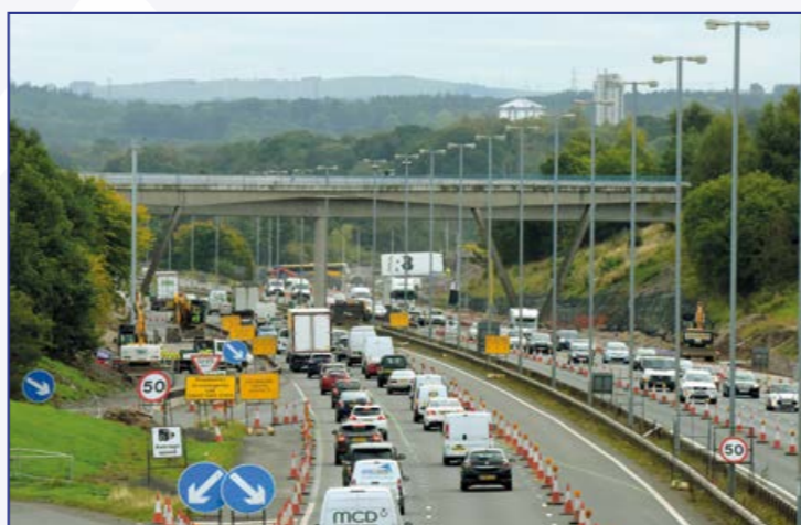
The bridge prior to November demolition

"It is one of the biggest challenges we have faced on the job, because we have never completely closed the M74 before. But after much consideration it was agreed by all the stakeholders that this was the best method.