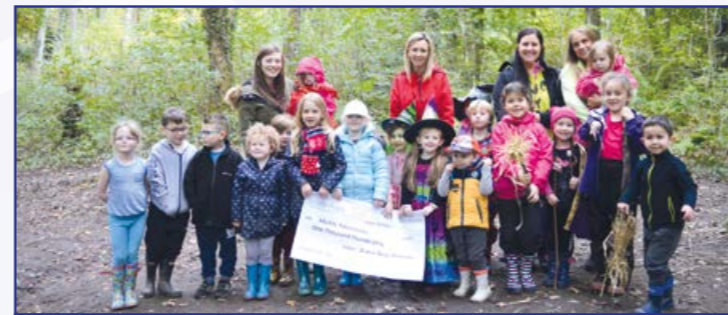
Muddy Adventures will be able to double their numbers thanks to £1,000 grant from the Project

Applications for the Good Neighbour Fund £1,000 Christmas Bonus must be received no later than 30 November, 2016. Applications received after that date will still be considered for grants of up to £500.