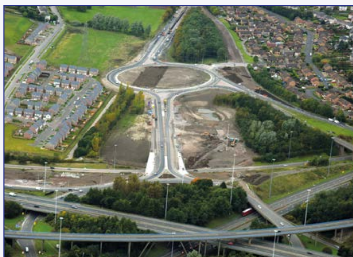
Swinton nears completion

"The new section of A8 all-purpose road connecting the existing A8 with the A89 at the new Bargeddie roundabout should also be completed in the coming months. Finishing works are currently ongoing."