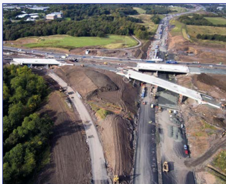
Progress at Shawhead Junction

"I am looking forward to completing the excavation of the underpass, which we hope to do by November. It was a great moment for me, personally, during the excavation when I was able to see daylight all the way through for the first time."