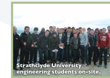
Strathclyde University engineering students on-site.