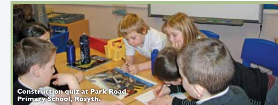
Construction quiz at Park Road Primary School, Rosyth.

The Community Liaison team is marking its first year of working with local residents, schools, universities, clubs, voluntary groups and the public in general.