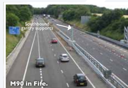
M90 in Fife.