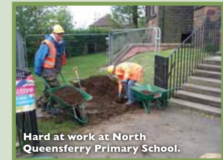
Hard at work at North Queensferry Primary School.