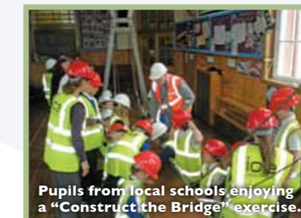
Pupils from local schools enjoying a "Construct the Bridge" exercise.