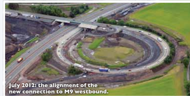
July 2012: the alignment of the new connection to M9 westbound.