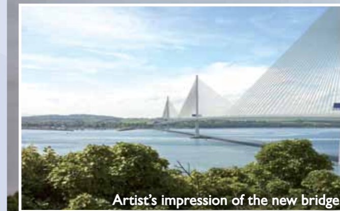
Artist's impression of the new bridge.