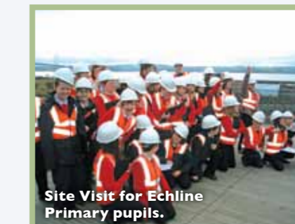
Site visit for Echline Primary pupils.