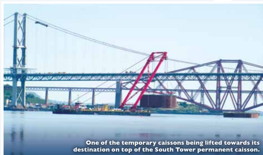
One of the temporary caissons being lifted towards its destination on top of the South Tower permanent caisson.

All work on the caissons is scheduled to be completed by the end of 2012.