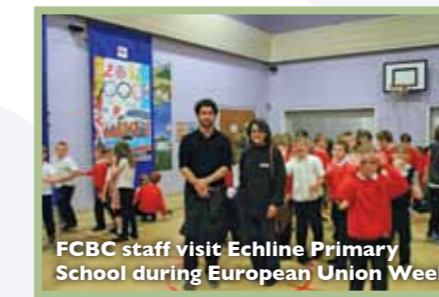
FCBC staff visit Echline Primary School during European Union Week.