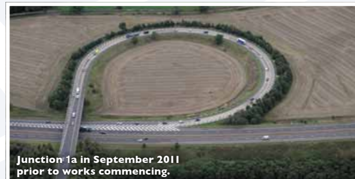
Junction 1a in September 2011 prior to works commencing.