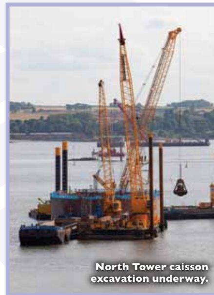
North Tower caisson excavation underway.

Concrete & de-watering. Once excavations are complete and the rock surface is cleaned of all debris using an air-lift suction device, up to 18,000 cubic metres of concrete will be poured into each caisson – in a non-stop, 24/7 operation lasting two