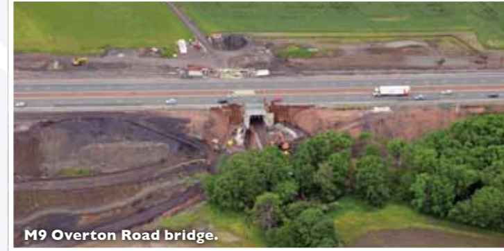
M9 Overton Road bridge.