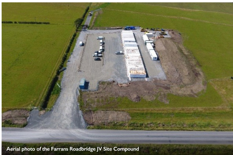
Aerial photo of the Farrans Roadbridge JV Site Compound

Completion of the project will encourage improved economic and employment opportunities through better journey time reliability for motorists and businesses along the length of the A737. In addition, the Dalry Bypass will help separate local traffic from strategic traffic and lead to improved safety for both rural road users and communities.