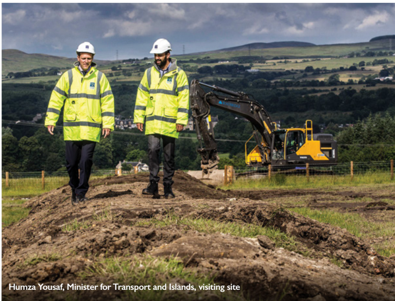
Humza Yousaf, Minister for Transport and Islands, visiting site

The A737 Dalry Bypass project involves the construction of a new bypass to the east of the town of Dalry and associated junctions to connect to the existing A737 trunk road.