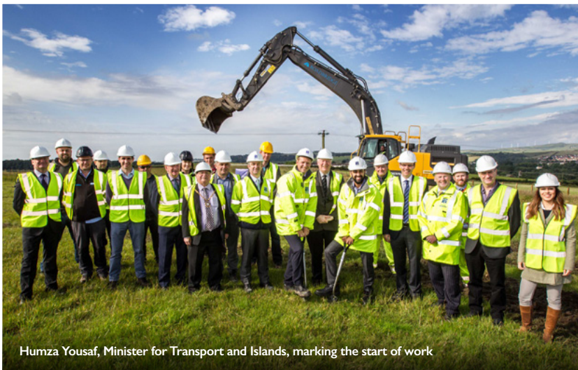
Humza Yousaf, Minister for Transport and Islands, marking the start of work

“The Scottish Government is committed to having a safer and more efficient transport network and the start of work today is another step forward to delivering this for the people of Scotland.”