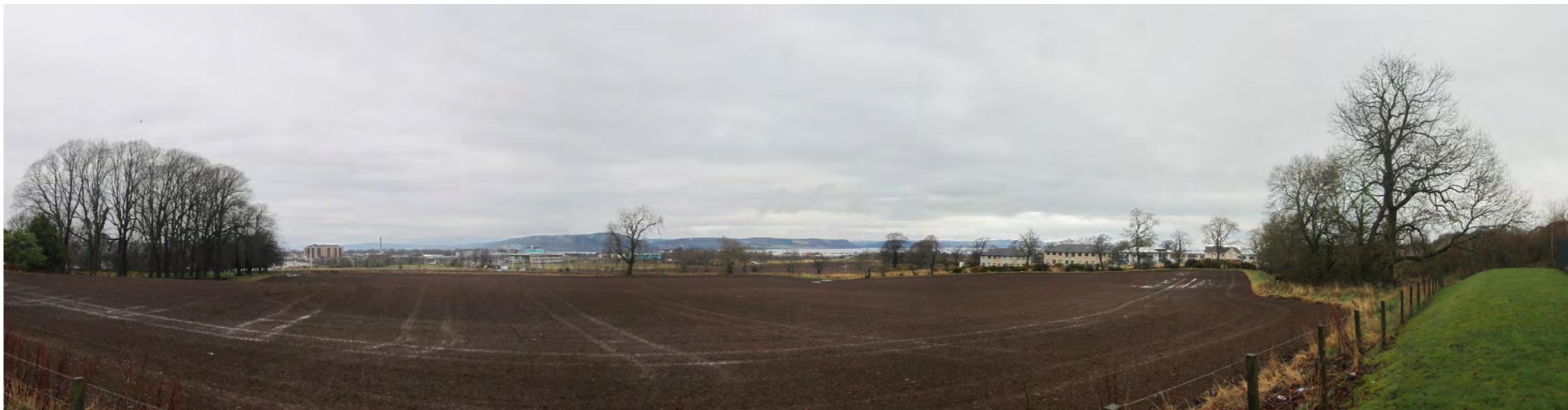
Viewpoint 2 - Enclosed Farmed Landscapes Local Landscape Character Area