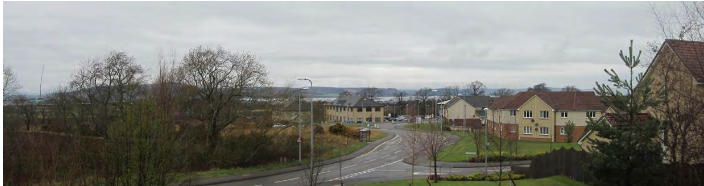
Viewpoint 1- Inverness Urban Fringe and Culloden Local Landscape Character Area