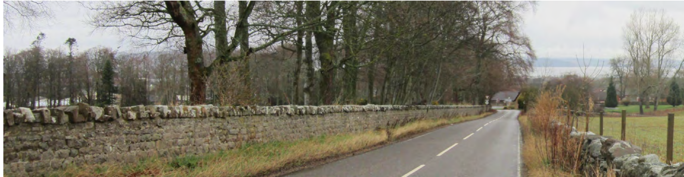
Viewpoint 3 - Coastal Lowlands Forest Edge Farming Local Landscape Character Area