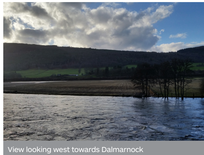
View looking west towards Dalmarnock

i To view all the exhibition panels including the three strip plans, please visit: transport.gov.scot/projects/a9-dualling-perth-to-inverness/a9-tay-crossing-to-ballinluig/