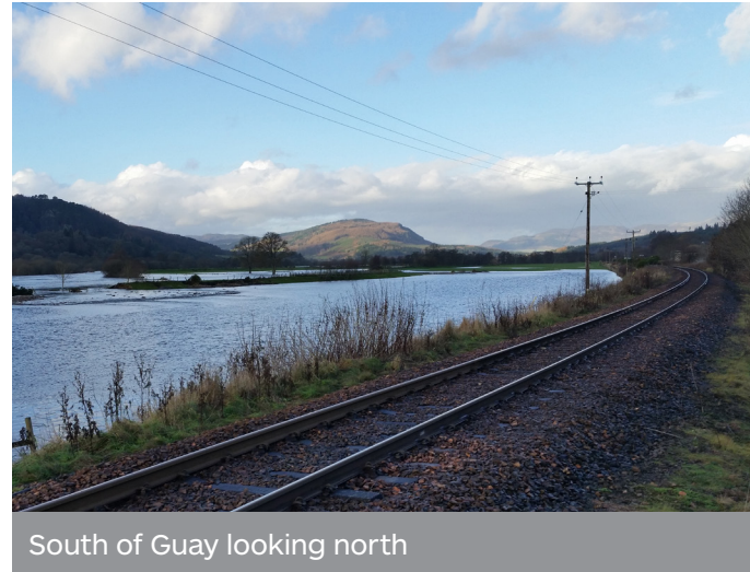
South of Guay looking north

These mitigation measures reduce the change in flood levels at key receptors (buildings, railway, A9) within the floodplain below 5mm.