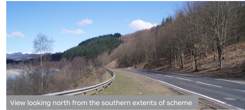
View looking north from the southern extents of scheme

i To view all the exhibition panels including the three strip plans, please visit: transport.gov.scot/projects/a9-dualling-perth-to-inverness/a9-tay-crossing-to-ballinluig/