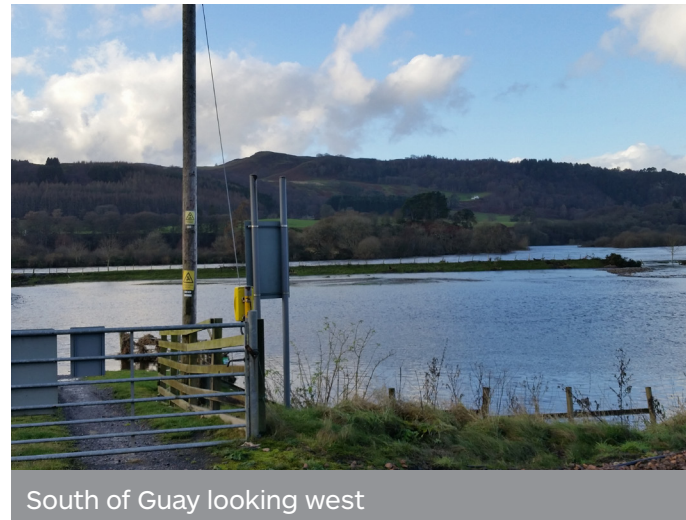
South of Guay looking west