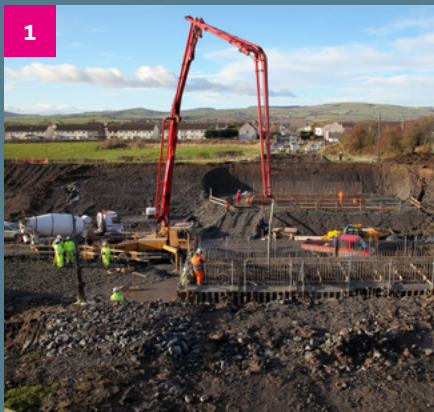
1 - 2. Construction of the abutment bases and walls for the Blair Road Bridge; 3. Edge beam being lifted into position; 4. Test Pile being installed at the River Garnock Viaduct

We have also constructed piling platforms and progressed with the installation of test piles for the structure over the River Garnock. Testing of these piles is now complete and the permanent piling has now commenced. Once the piles are in place a pile cap will be constructed followed by the installation of the columns and abutment walls to support the bridge deck.