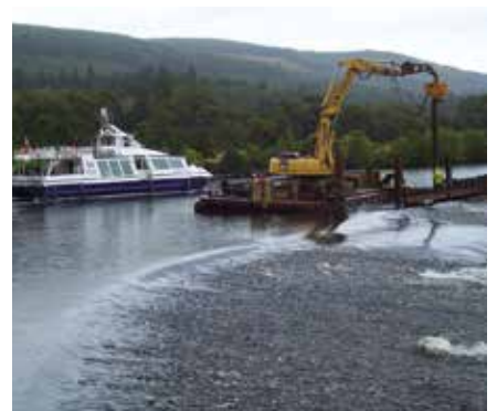
Ness Weir construction