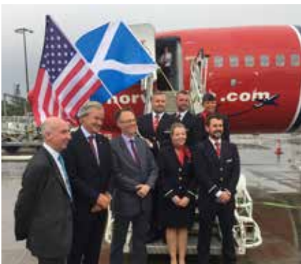
Norwegian Air launching new routes

The 102 metre, roll-on/roll-off vehicle passenger ferry can operate on liquefied natural gas (LNG) and marine gas oil (MGO). LNG is significantly cleaner and will help to reduce emissions and meet ambitious Scottish Government targets.