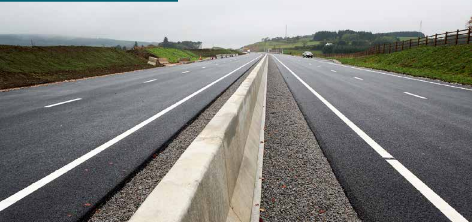
White lining at Derbeth Kingswells - AWPR