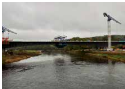
River Dee Crossing on the AWPR

Work has also continued on the development and assessment of the route options for the 46km dualling of the A96 between Hardmuir and Fochabers . The route options under consideration for the scheme were presented at public exhibitions on 19-22 June for vital feedback. The preferred option for the scheme is expected to be identified later in 2018.