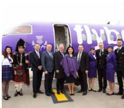
FlyBe launching new routes