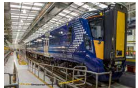
385 Electric Train