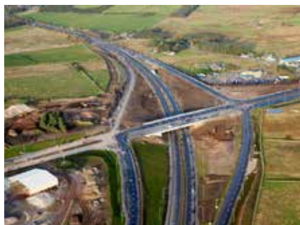
The new Charleston Overbridge on the AWPR