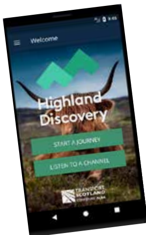
The Highland Discovery tourism app

Since appointing design consultants in September 2016, we have been working hard to identify and undertake an initial assessment of options for the planned improvements at Laurencekirk junction . The options were presented to the public at an exhibition on 30 October 2017 with the preferred option itself expected to be announced in 2018.