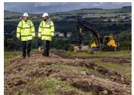
Groundbreaking ceremony at A737 Dalry Bypass