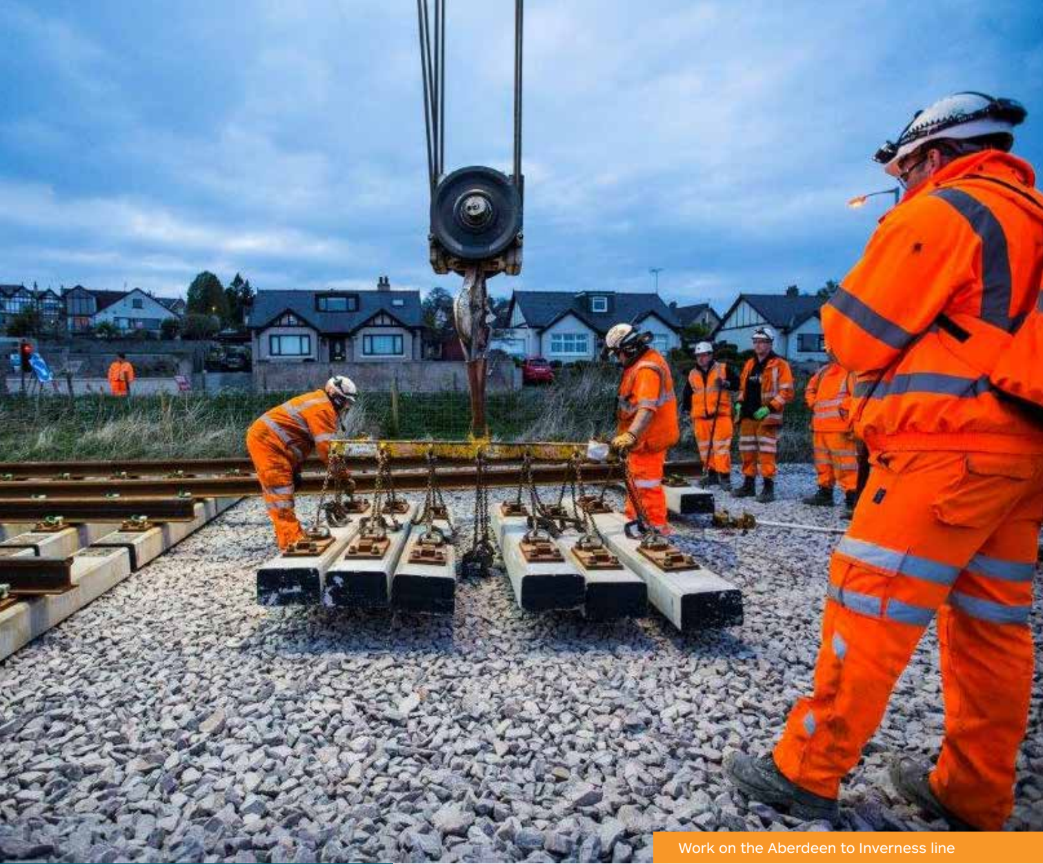
Work on the Aberdeen to Inverness line