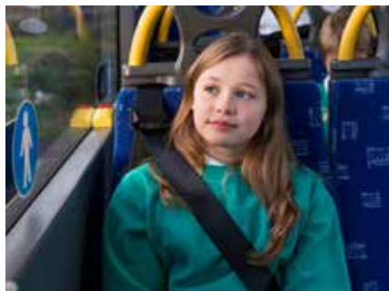
The Seat Belts on School Transport (Scotland) Bill

The Concessionary Travel Policy Team supported the Minister for Transport and the Islands in his personal engagement with older people's organisations and groups representing young modern apprentices.