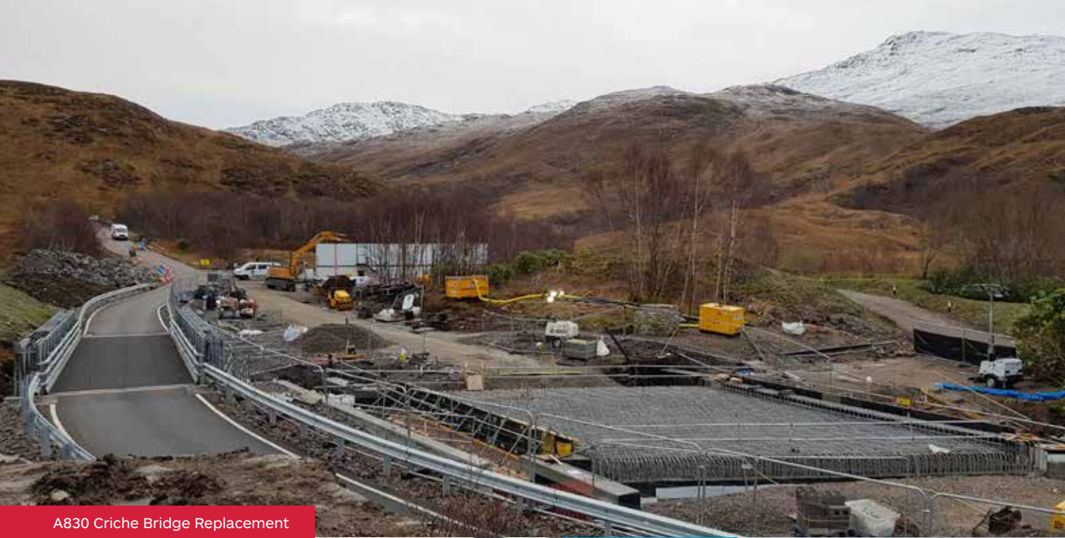
A830 Criche Bridge Replacement