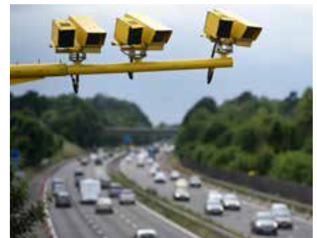
A90 Average Speed Cameras

Finally, at the end of the year we supported the development of, and Ministerial launch for, Glasgow's smartzone - bringing unlimited travel on one smartcard accepted by multiple bus operators in the Glasgow area - joining the successful Aberdeen and Dundee smartzones launched last year.