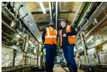
Minister for Transport & the Islands at Wabtec Rail in Kilmarnock

Funding of up to 100% of the cost of the rail works has been approved by Transport Scotland through the Scottish Strategic Rail Freight Investment Fund.