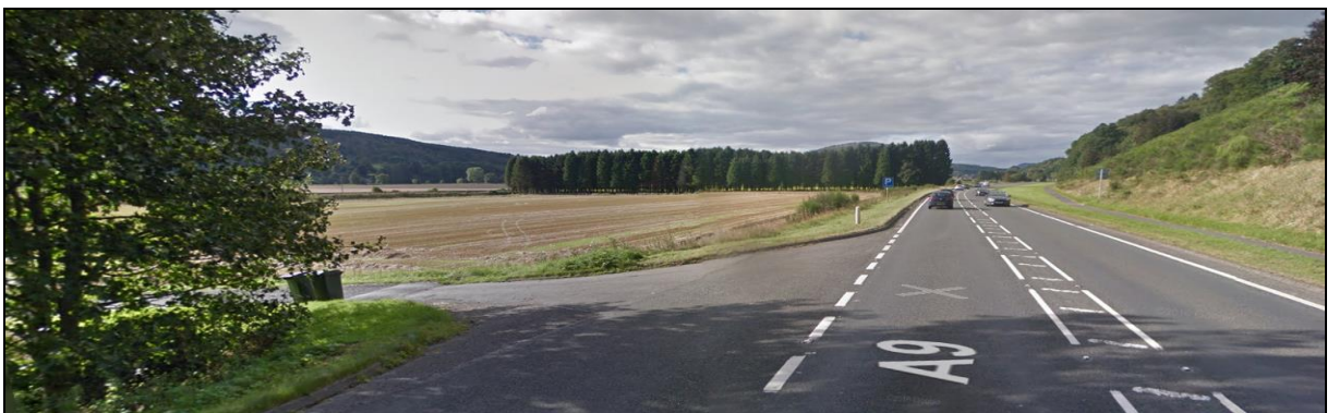
Image from Google Street View captured September 2016 © 2018 Google