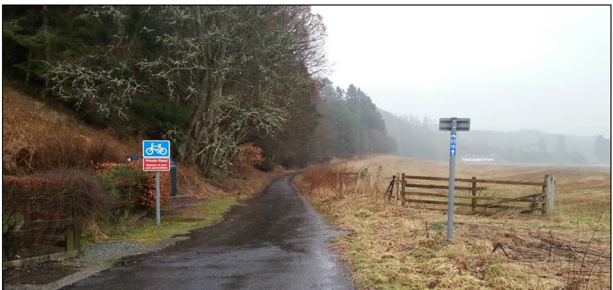
Photograph 9.3: Path 63/RCR 83 view at Kindallachan south towards Guay