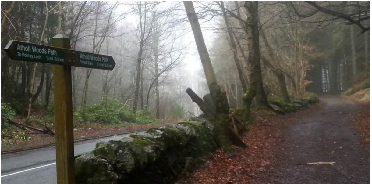
Photograph 9.1: Core Path within Atholl Woods linking to Regional Cycle Route (RCR) 83, leading towards Mill Dam

9.3.5 There are nine paths designated as core paths within the study area, as shown on Figure 9.1 and described in Table 9.11. Photograph 9.1 is of one of the core paths within Atholl Woods.