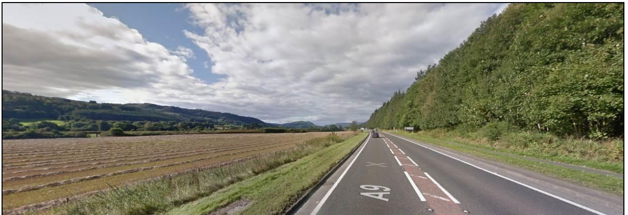
Image from Google Street View captured September 2016