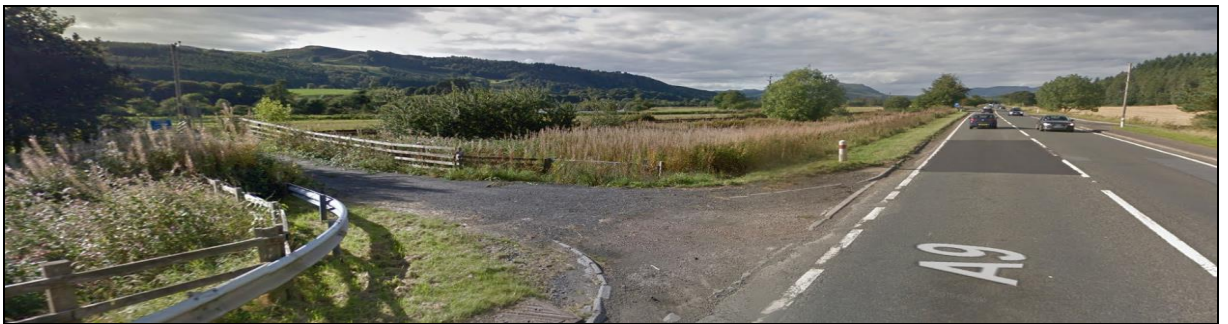
Image from Google Street View captured September 2016 © 2018 Google