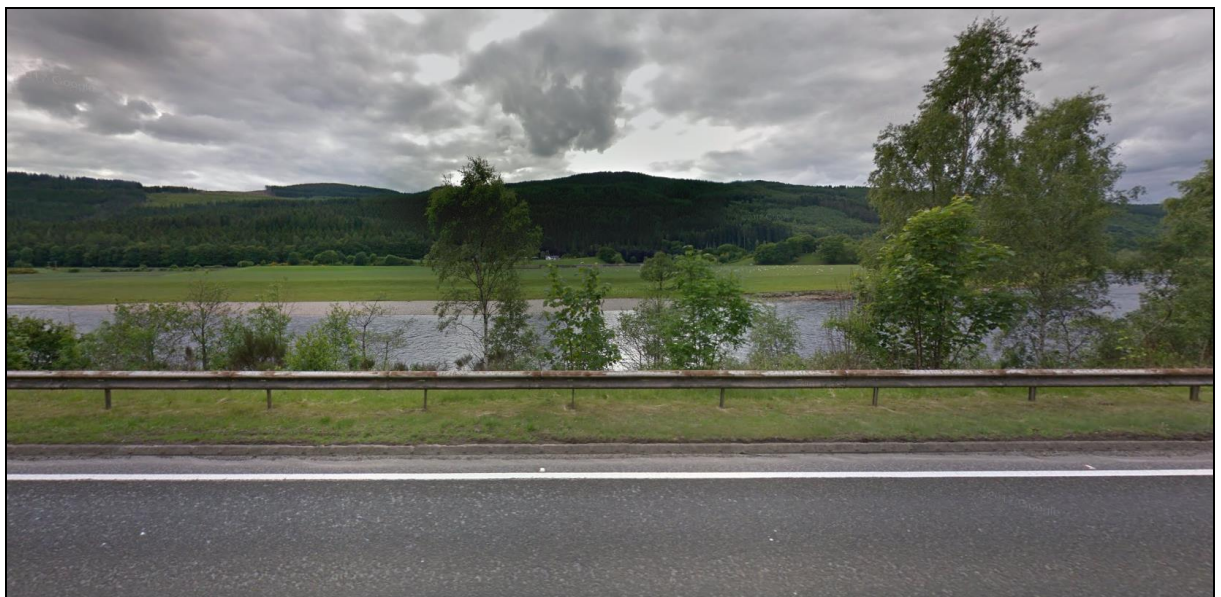
Image from Google Street View captured September 2016