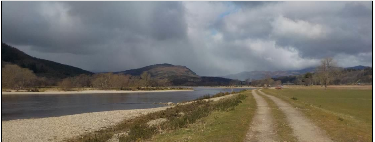
Photograph 9.2: Local Path alongside River Tay (Path 58)