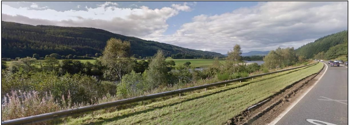
Image from Google Street View captured September 2016 © 2018 Google