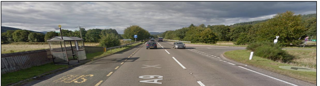
Image from Google Street View captured September 2016