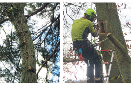
Examples of integrated naturalised tree features (INTFs) and an integrated bat box being created as part of the advance works on Luncarty to Pass of Birnam