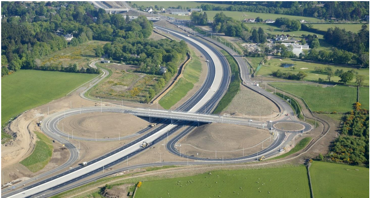
Aberdeen Western Peripheral Route/Balmedie to Tipperty