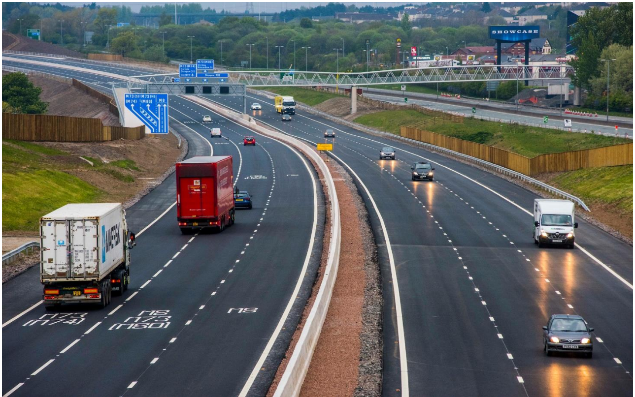
M8 M73 M74 Motorway Improvements Project