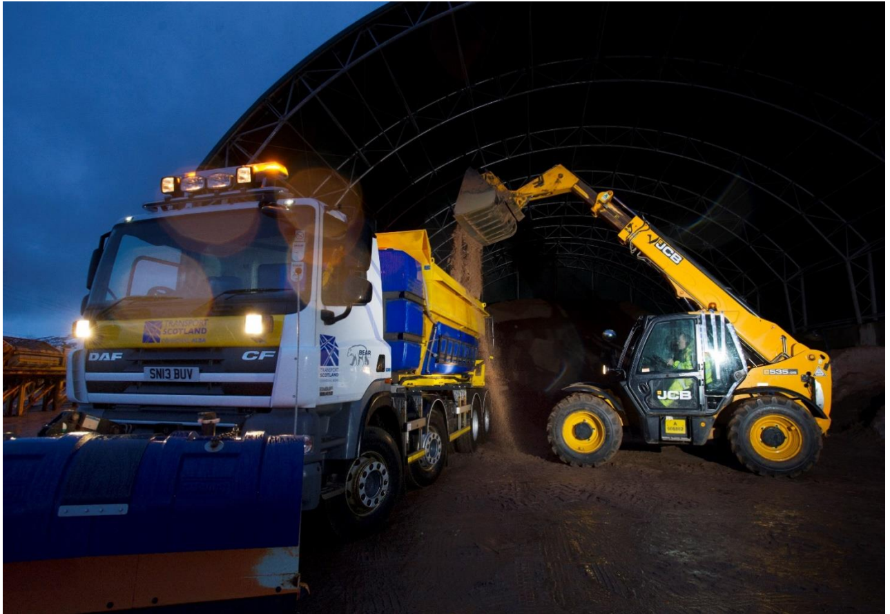
Fourth Generation Trunk Road Network Operating Contracts – North West, North East, South West & South East