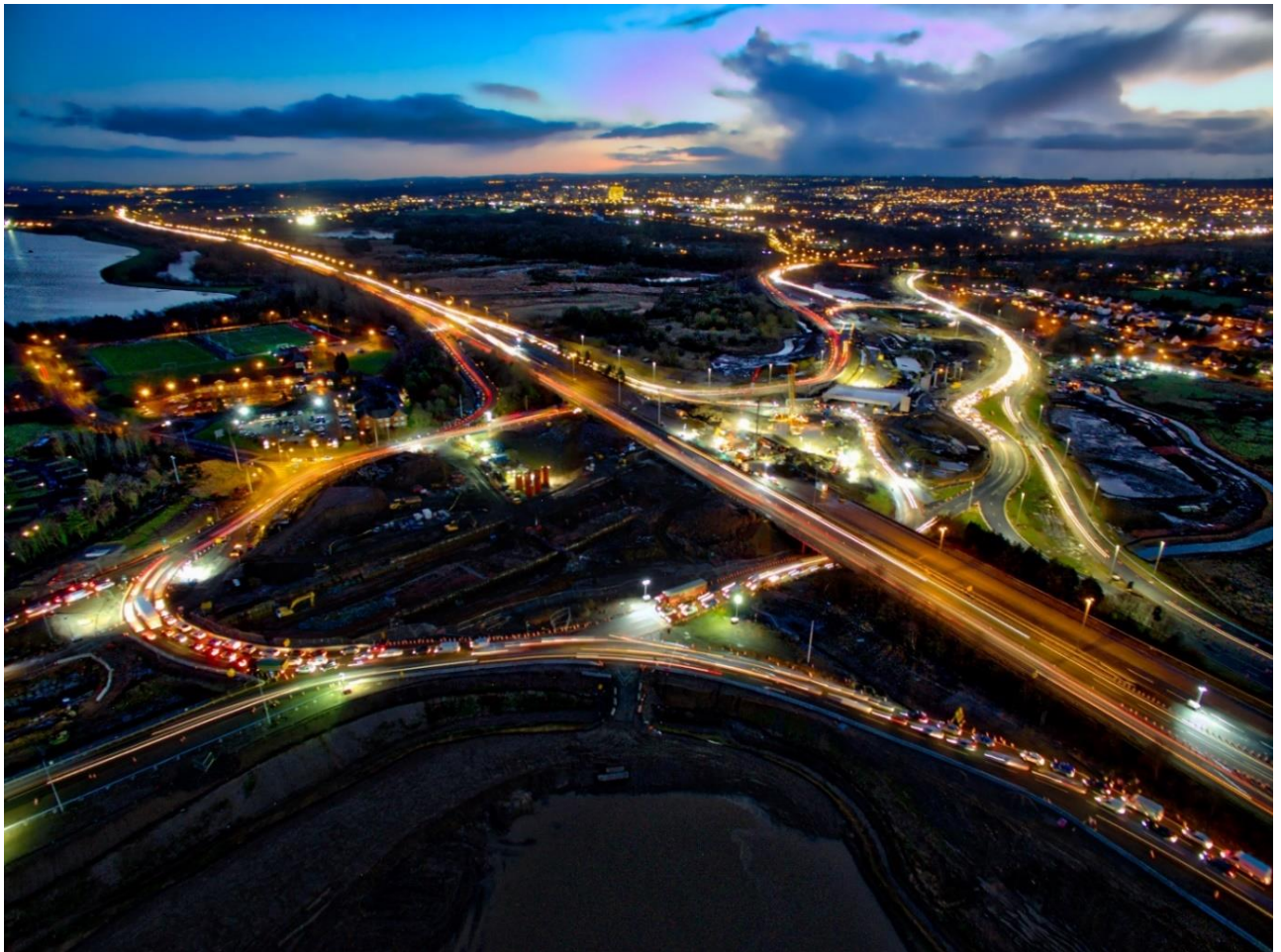
M74 Raith Junction 5