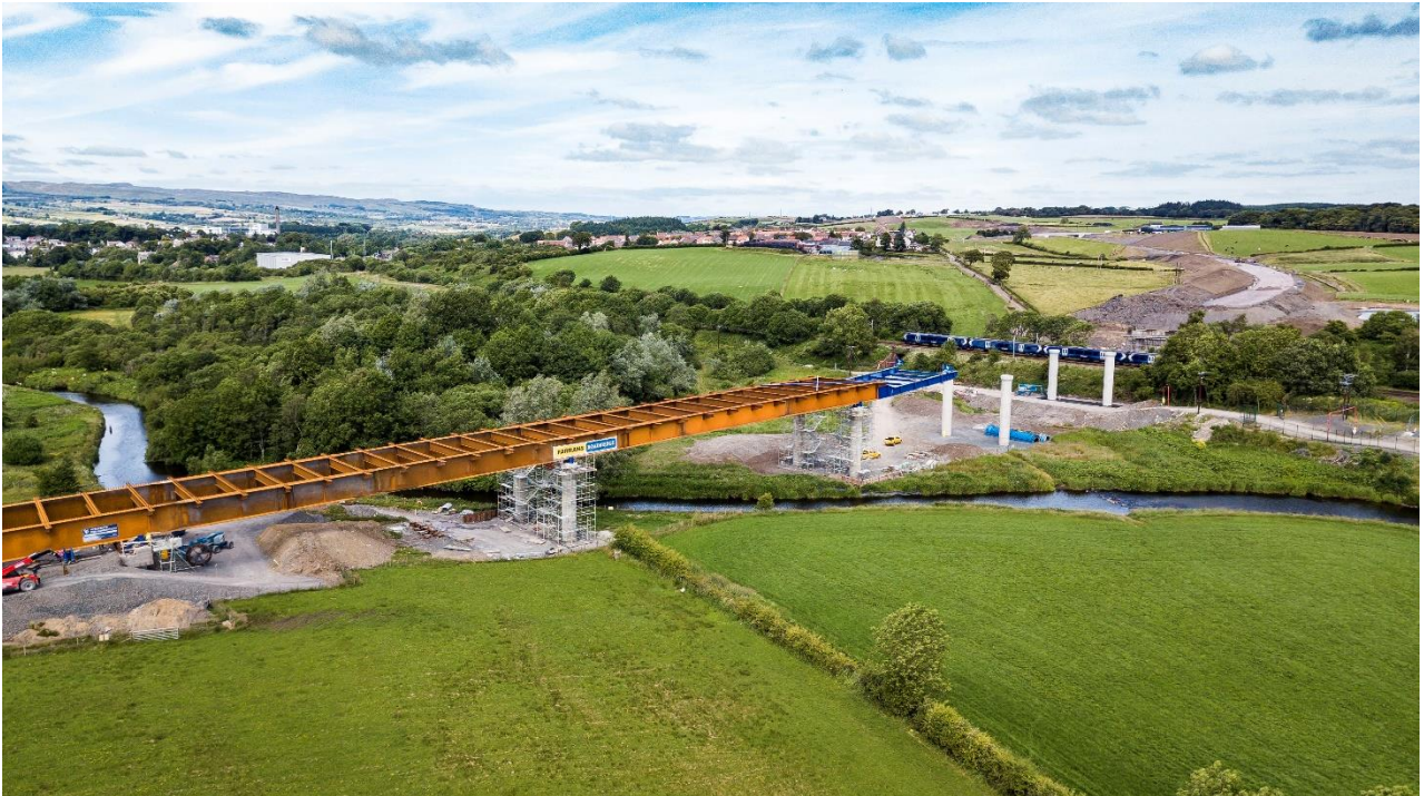
A737 Dalry Bypass