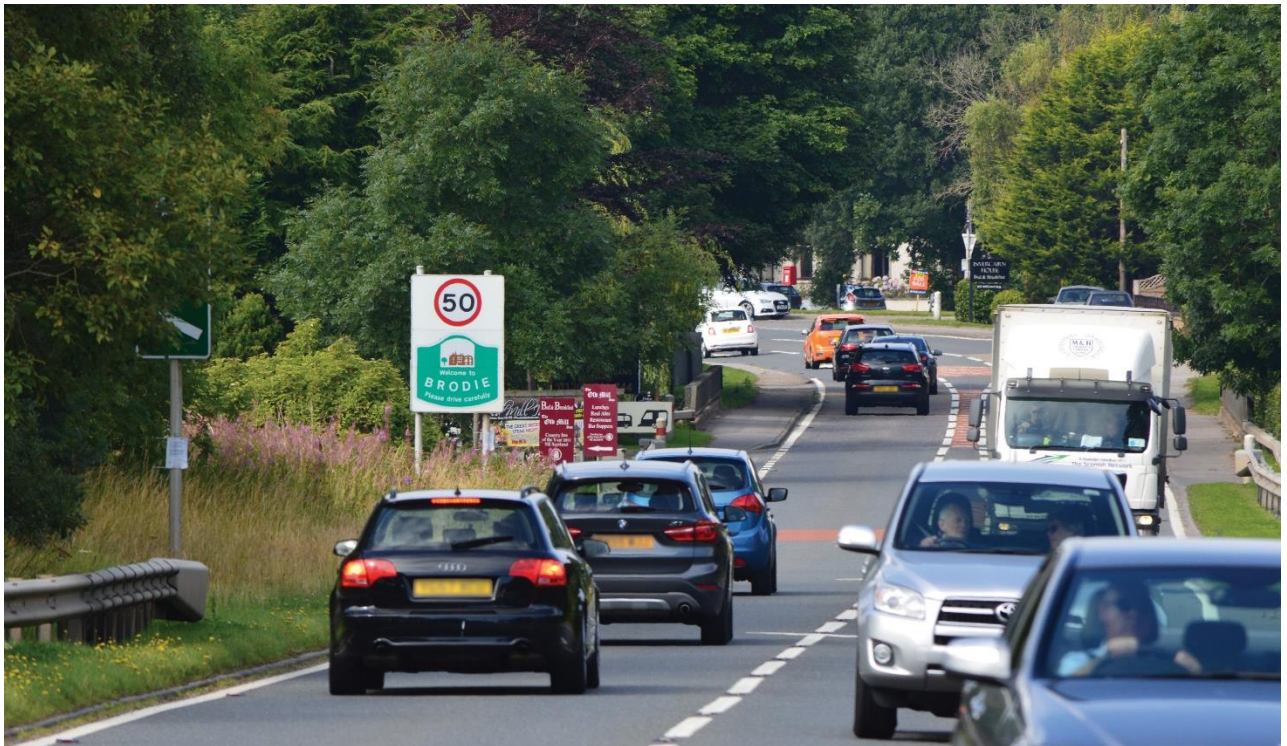
A96 Dualling: Hardmuir to Fochabers