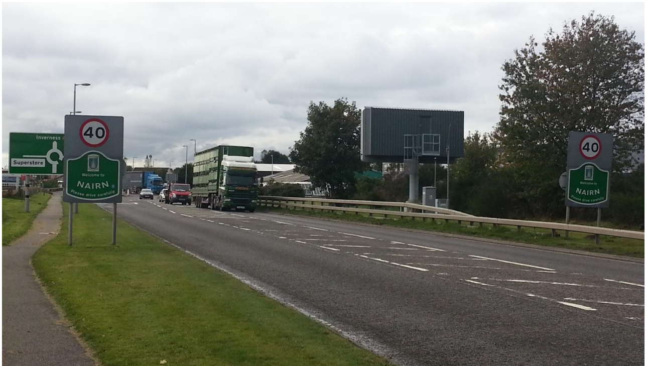
A96 Dualling: Inverness to Nairn