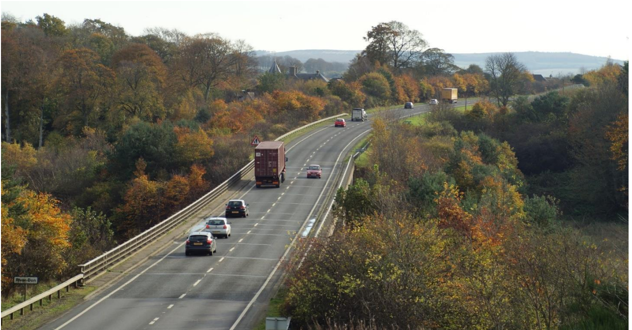
A96 Dualling: East of Huntly to Aberdeen