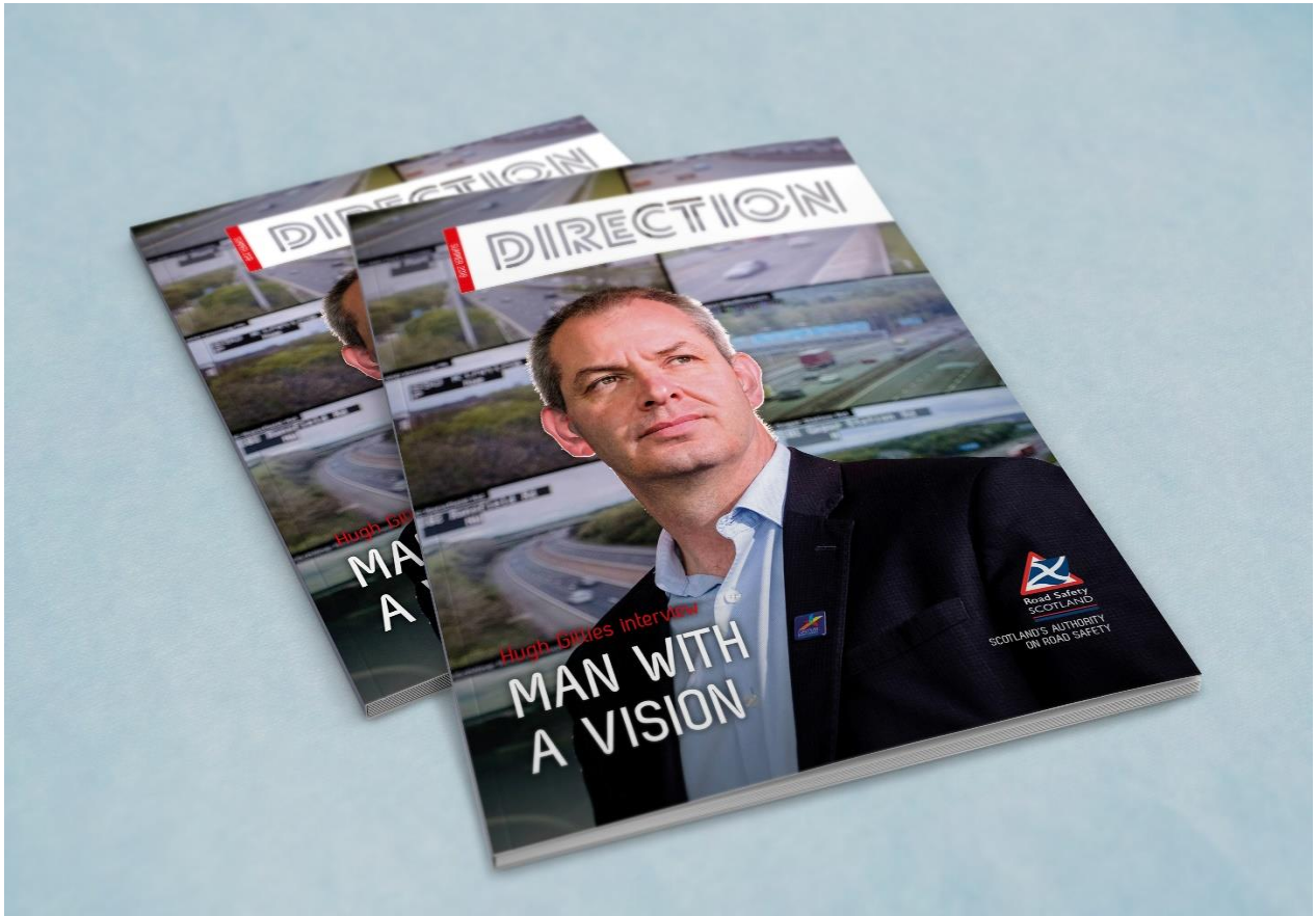
Road Safety Scotland Biannual Direction Magazine