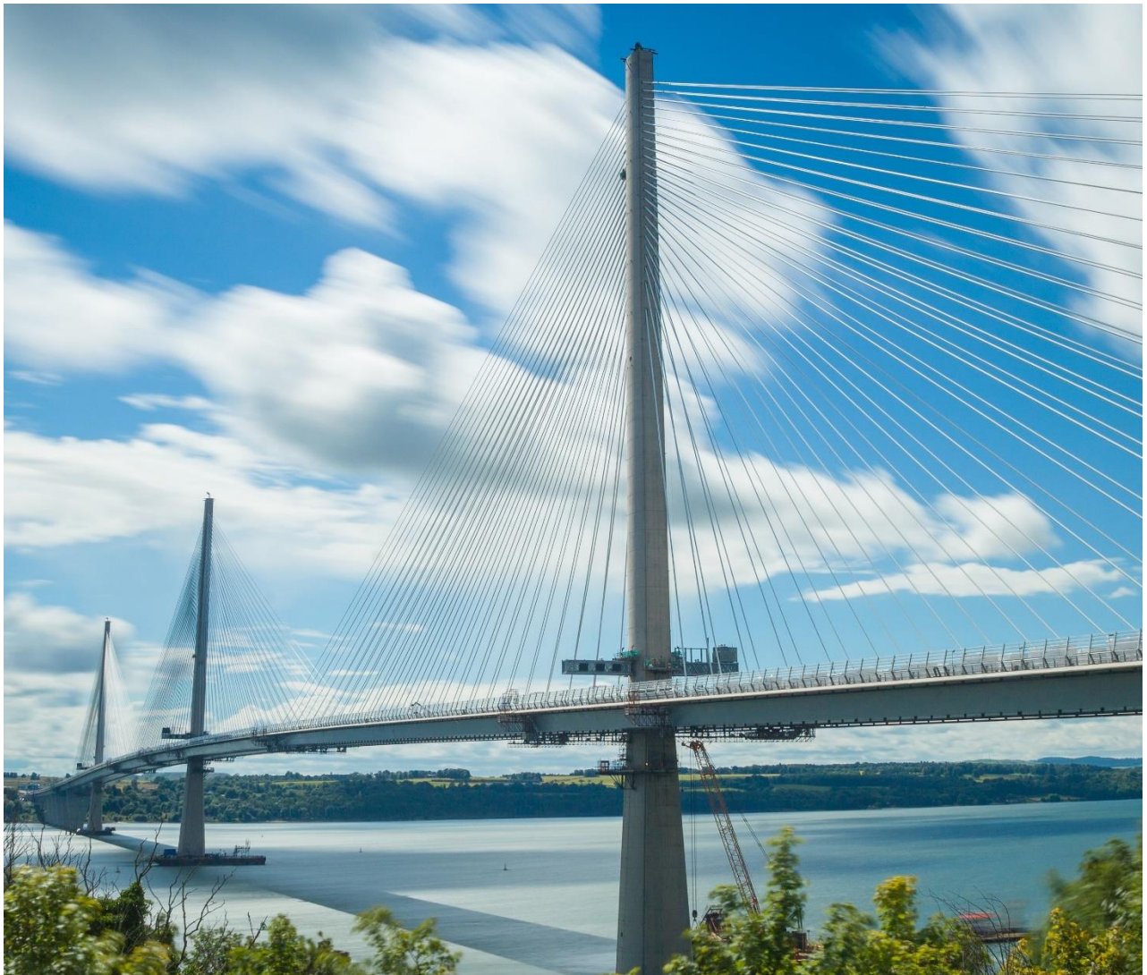
Forth Replacement Crossing