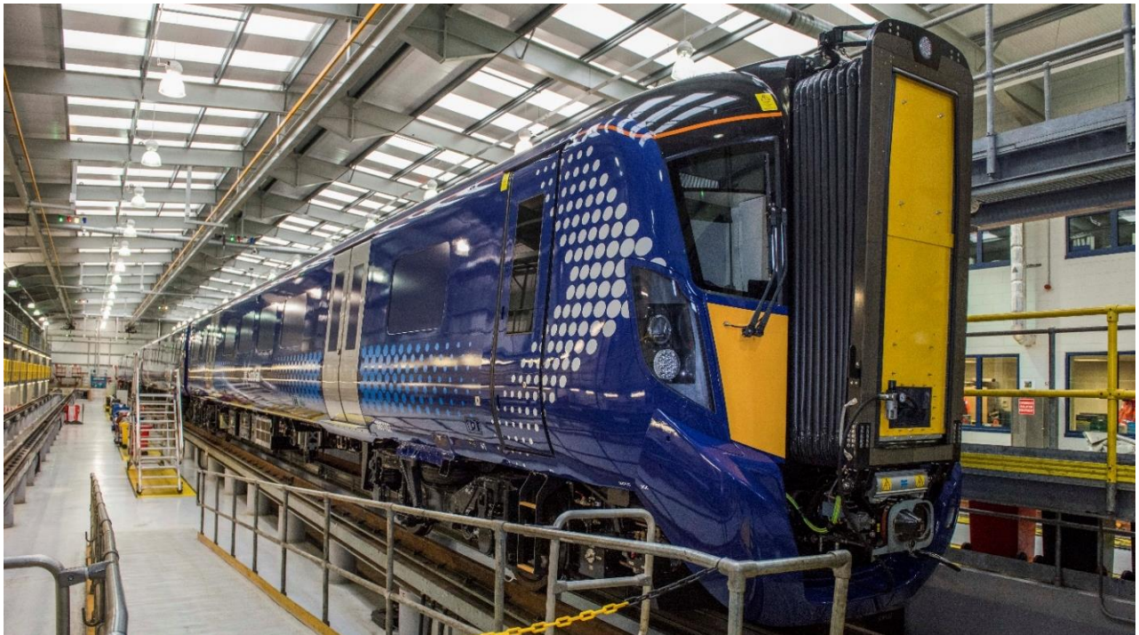
Scotrail Franchise Renewal