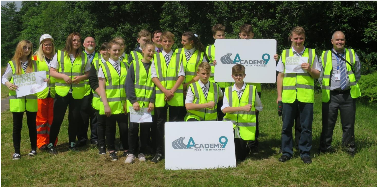
Multi-Disciplinary Programme Support Services Contract for the A9 Trunk Road Dualling - Lot 1 - Glen Garry to Dalraddy, Lot 2 - Birnam to Glen Garry and Lot 3 - Dalraddy to Inverness