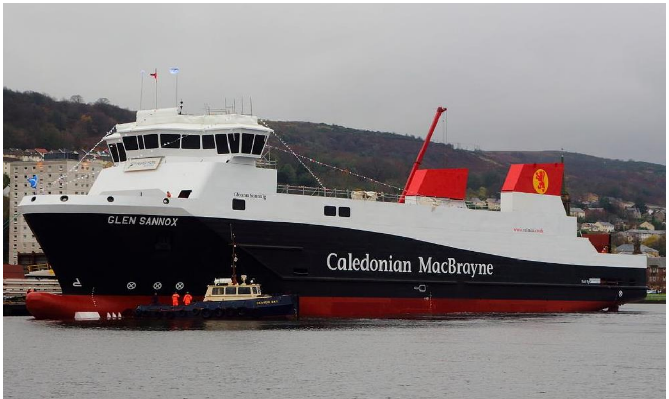
Clyde and Hebrides Ferry Services