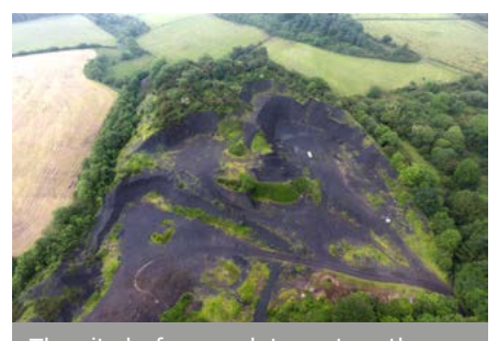
The site before work to restore the quarried land was undertaken

Prior to restoration, the site had no potential to support any crops. To achieve the desired result, boulder clay was used as a subsoil which provided additional depth to the soil profile to support the intended crop growing and provided flexibility for the long-term