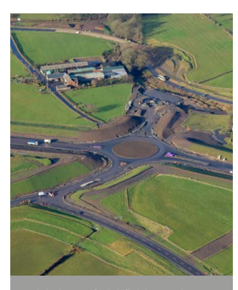
Aerial photo of Highfield Interchange

Safety barrier, street lighting and road sign installation are well under way and will be followed by the placement of the final road surface layer and road markings.