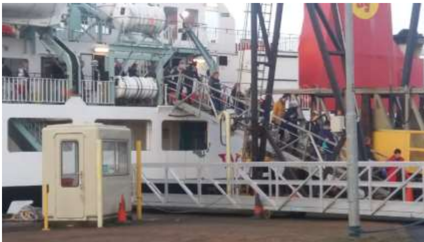
Photo 1. The gangway at Ardrrossan showing a 45 o angle, which is extremely difficult for disabled travellers to negotiate.

The angle of a gangway and the surface of the gangway need to be carefully considered for all people with a disability. Wheelchair users cannot negotiate a surface which is uneven, those with a visual impairment need an obstacle free gangway and mobility impaired people often find steep gradients impossible. The Scottish Building Standards advise that 'Gradients of more than 1 in 12 are considered too steep to negotiate safely and are not recommended'.