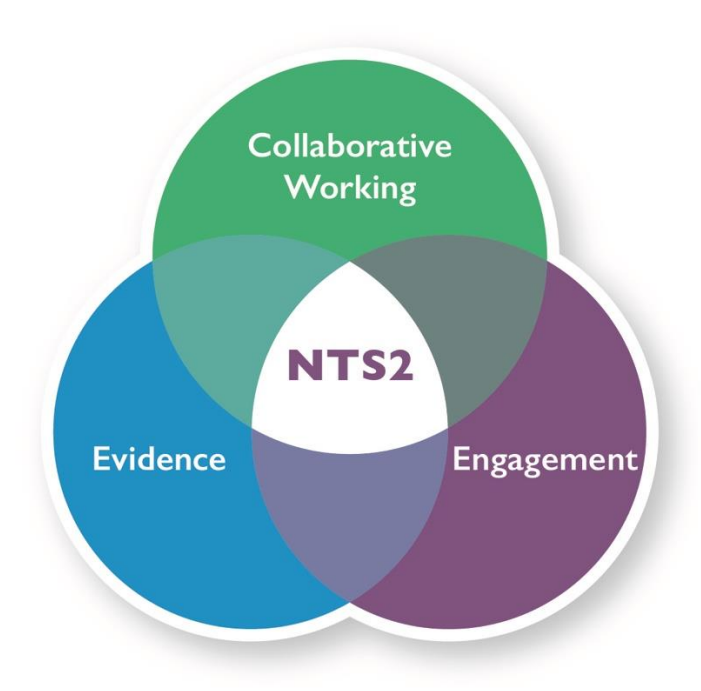
Figure 1: National Transport Strategy – Collaboration, Evidence and Engagement Pillars of the Review

A review of the 2006 National Transport Strategy was undertaken and based on three pillars: collaborative working with partners, engaging with stakeholders and building an evidence base.