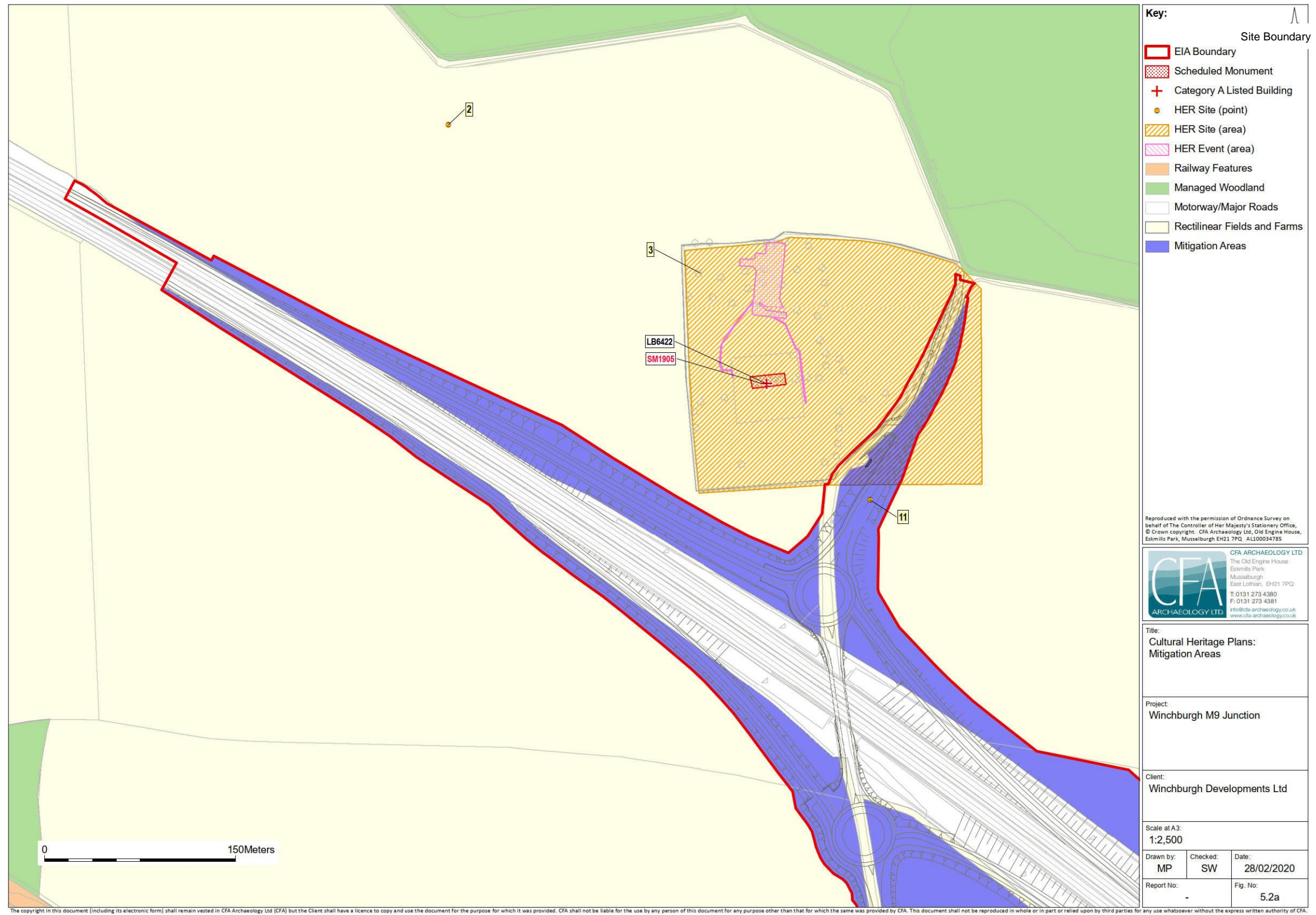
Figure 5.2a: Cultural Heritage Plan: Mitigation Areas