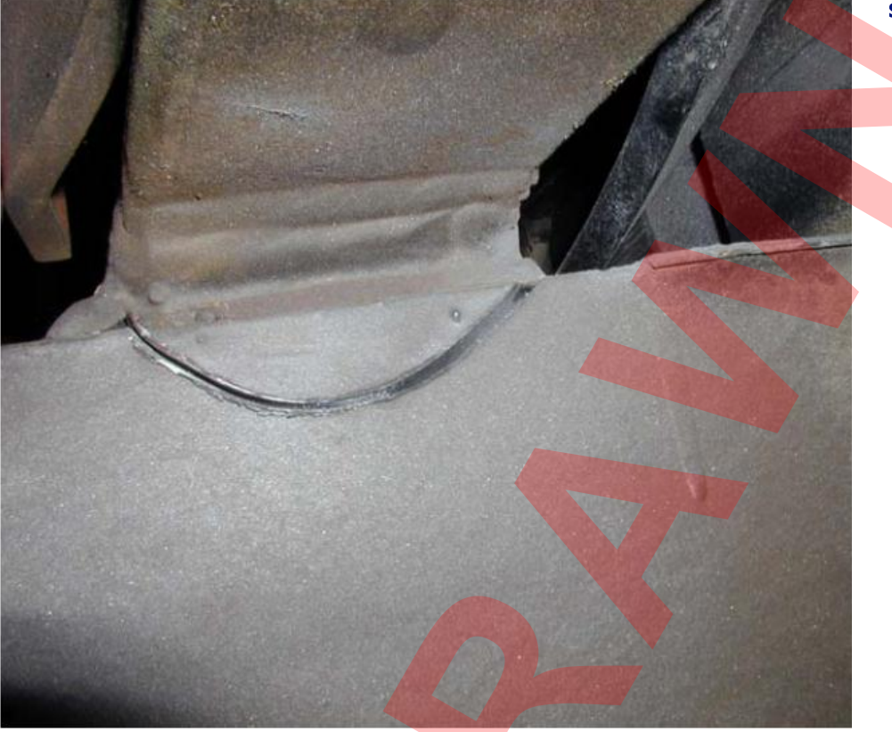
Figure 3 Cable Stayed Bridge (Composite steel-concrete deck) Built 1991 [Fracture in the support joist immediately below the welded connection to the rail.]