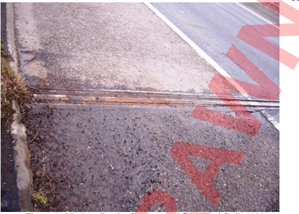
Figure 9 Viaduct (In-situ Prestressed Concrete) Built 1990 [ Corrosion to rails and debris in seals.]