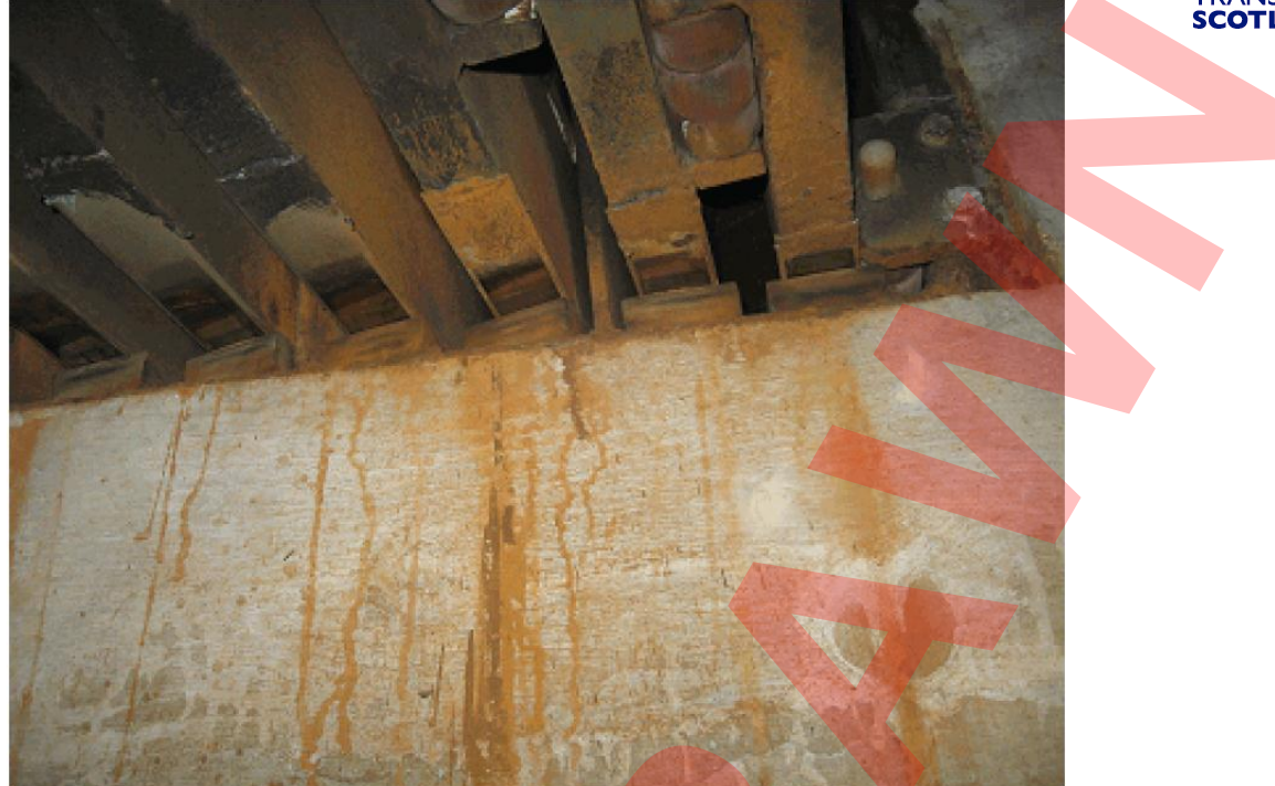
Figure 5 Cable Stayed Bridge (Composite steel-concrete deck) Built 1991 [ Corrosion to expansion joints sliding plates over pier.]