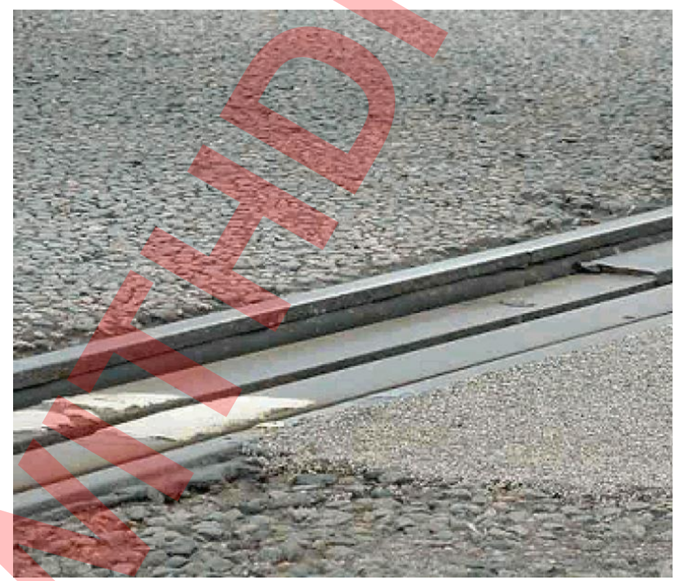
Figure 8 Viaduct (Insitu concrete deck) Built 1986 [Damage to the West Deck Expansion Joint- Rail broken in the middle and level difference.]