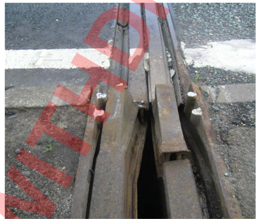
Figure 6 Cable Stayed Bridge (Composite steel-concrete deck) Built 1991 [Trimmer Beam Support Steelwork corroded.]