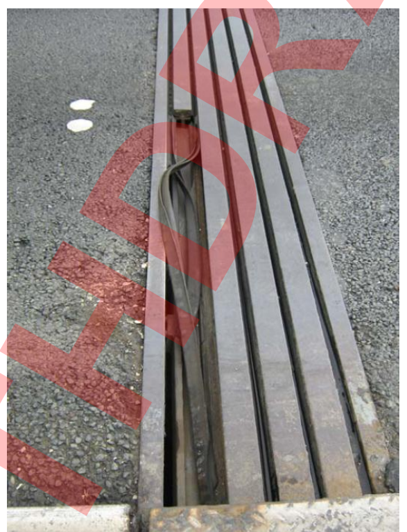
Figure 2 Viaduct (Precast Prestressed Concrete) built in 1993 [The damaged rail has been taken out of the joint and corrosion is visible on the rails.]

The photographs below show some defects discovered on bridges during inspections.