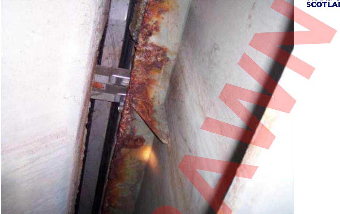
Figure 7 Viaduct (Precast Prestressed Concrete) Built 1976 [Failure of joint on footway. Seal failed between rails on carriageway.]