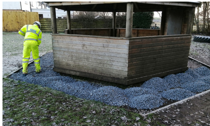
James levelling off the gravel around the outdoor classroom

The outdoor classroom is a great resource for the school, but the paths surrounding it were badly in need of improvement. One of the project's subcontractors, Breedon, generously donated more than £1,000 worth of gravel and delivered it to the school to improve access around the structure. A small team of project volunteers spent the morning in the school grounds, transporting the gravel by