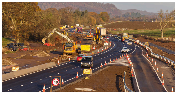
Looking north from the new Stanley/Tullybelton junction

As part of the new traffic management layout, the new slip roads to the east side of the new Stanley/Tullybelton Junction also opened to traffic, allowing road users access to the new Luncarty Link Road and removing Luncarty North Junction from operation.