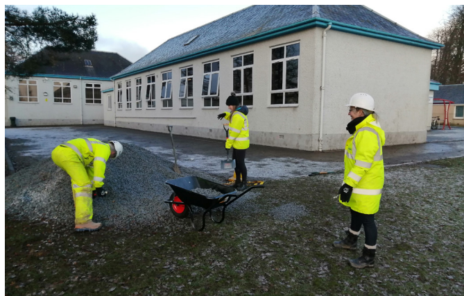
Hard at work moving 10T of gravel by hand

Schools have quickly had to adapt the way they operate to keep pupils and staff safe, with many children spending more time outdoors. Auchtergaven Primary School in Bankfoot contacted the project team for assistance to improve their outdoor space, allowing them to use it more freely during the winter months.