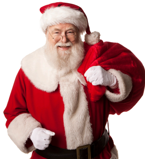
Santa Claus is coming to town!

I am delighted to say that it's a very short list. Boys and girls across the world have been very good this year – helping each other, showing kindness through challenging times and working together in their communities to support their friends, family and neighbours. I know it's going to be a different Christmas than many are used to, but I am wishing everyone a very Merry Christmas. Ho, ho ho!