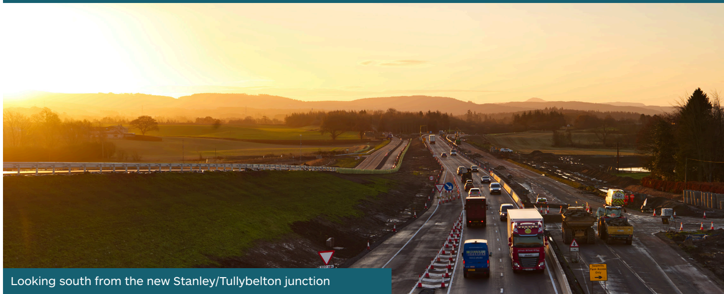
Looking south from the new Stanley/Tullybelton junction

The A9 Dualling: Luncarty to Pass of Birnam project reached a significant milestone on 17 November 2020, as the A9 traffic was switched onto a new section of the recently constructed carriageway between Bankfoot North Junction and the old Luncarty North Junction.