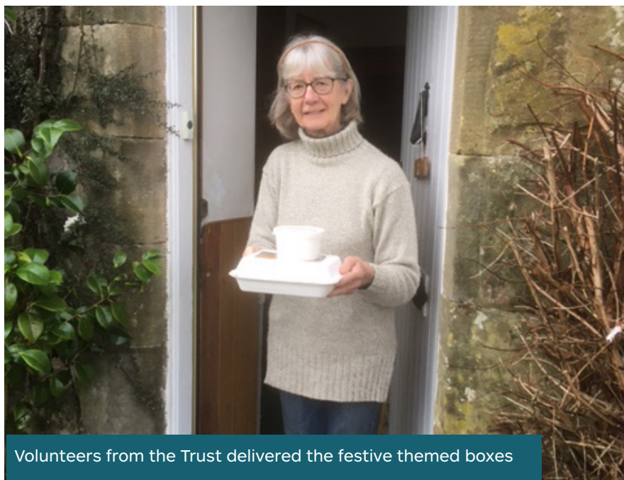
Volunteers from the Trust delivered the festive themed boxes