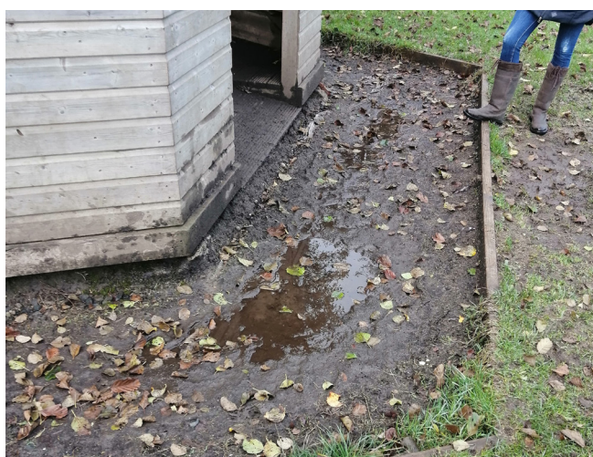
The path surrounding the outdoor classroom was waterlogged and muddy

Reconomy, the project's waste management supplier donated the use of a skip to allow the school to dispose of old planters and equipment being stored in the playground to make more space for the pupils to play.