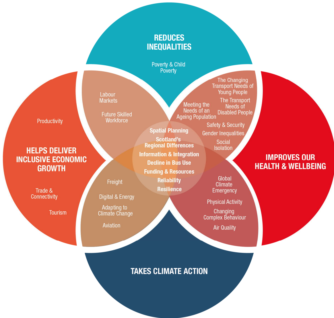
Figure A.2: : Current and Future Challenges

STPR2 is being developed within a period of rapid policy change across Scottish Government and is working collaboratively with the teams developing the Climate Change Plan Update and National Planning Framework 4 during the course of 2020 and 2021.