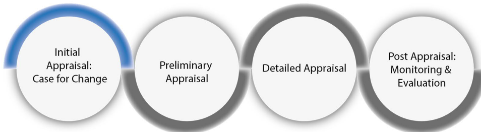
Figure A.3: The Four Key Stages to the Scottish Transport Appraisal Guidance

STAG represents best practice in transport appraisal guidance adopting an evidence-based and objective-led process. The four key phases of STAG are illustrated in Figure A.3.