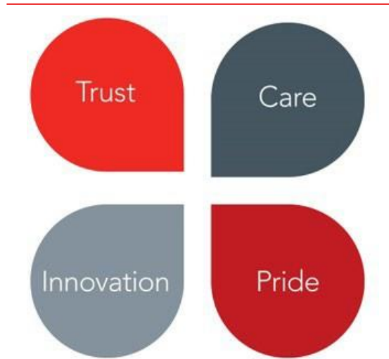
Figure 5: Our Serco Values

Since 2012, we have rolled out our Serco Values (see Figure 3) that guide us in our dealings with colleagues, customers, suppliers, partners, shareholders and the communities we serve. Our induction programme ensures that everyone understands our values and brings our values to life. We have written a Code of Conduct, which describes the standards and behaviours we expect of people who work for Serco. Everyone within Serco and at NorthLink receives training to raise awareness of our Code.