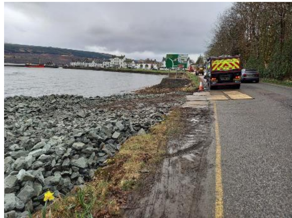
A83 110 Aray Scour