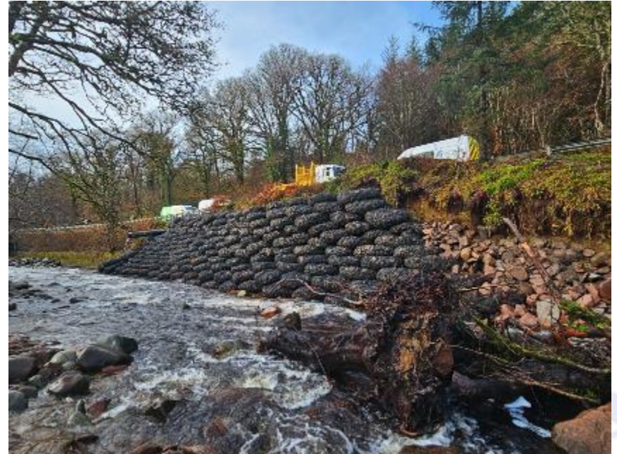
A83 Furnace Bank Erosion