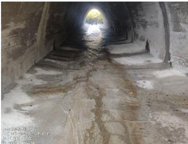
A82 610 Allt Coire Chailein Scour Repair