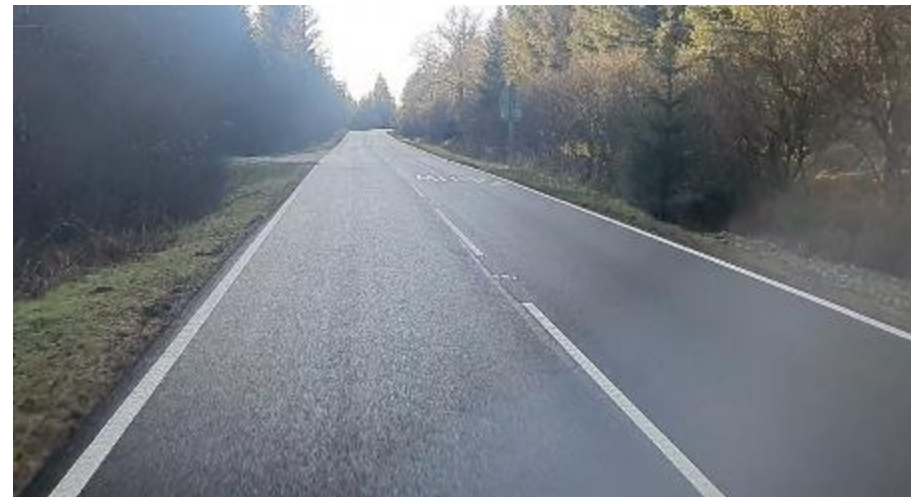
A83 North of Port Ann (September 2024)