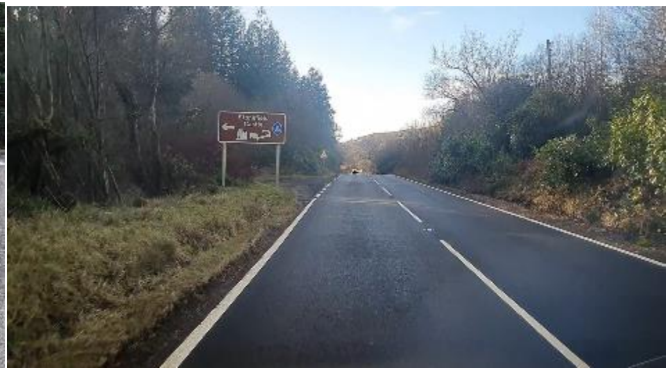
A83 Stonefield (October 2024)