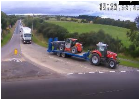
Location/time: A9 Tore Roundabout A823(E) 10 September 2020 17:09