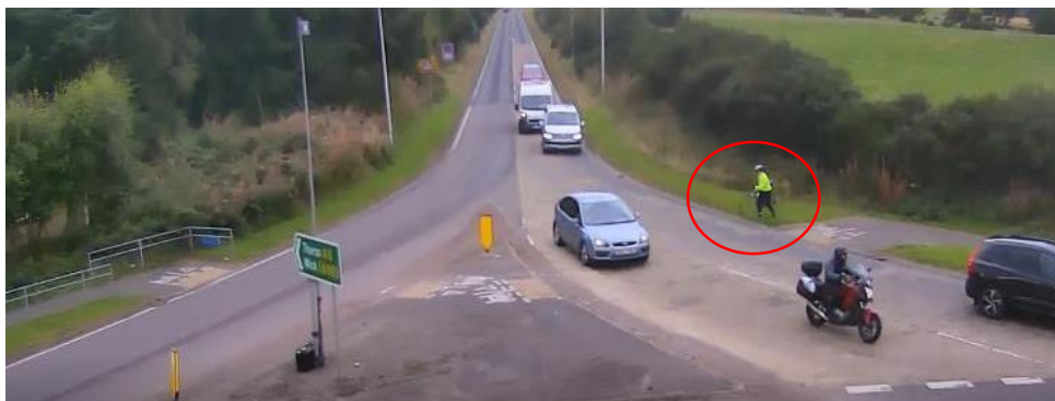
Location/time: A9 Tore Roundabout looking towards the A9 north exit 11 September 2020 Description: Cyclist moved quickly to be avoid being hit by car