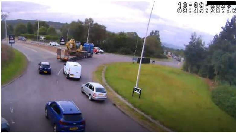
Location/time: A9 Tore Roundabout looking towards the A9 south exit 10 September 2020